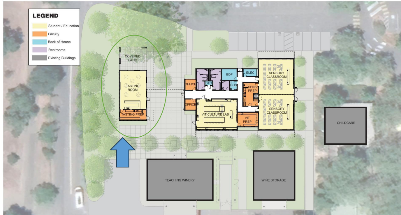
NAPA VALLEY COLLEGE WINE EDUCATION CENTER